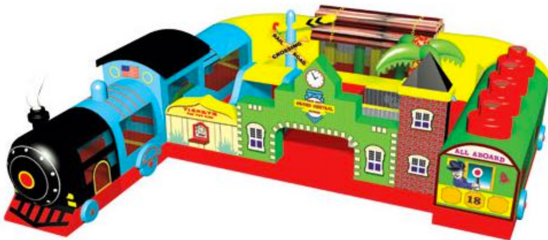
Ninjabump – FUNTIME EXPRESS