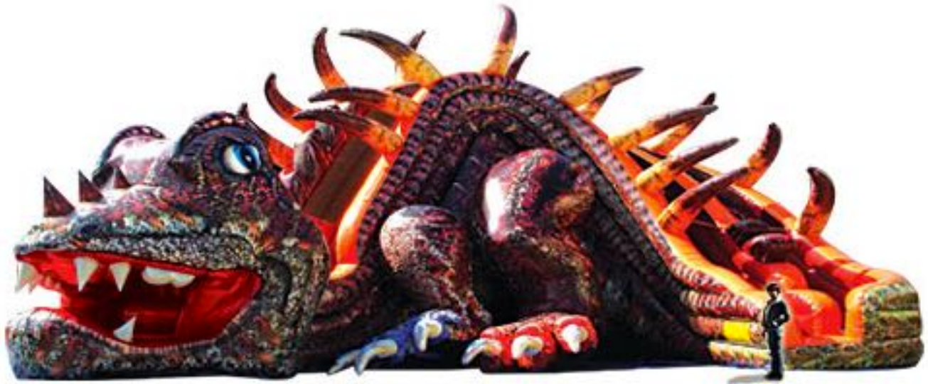
Ninjajump - NINJASAUR