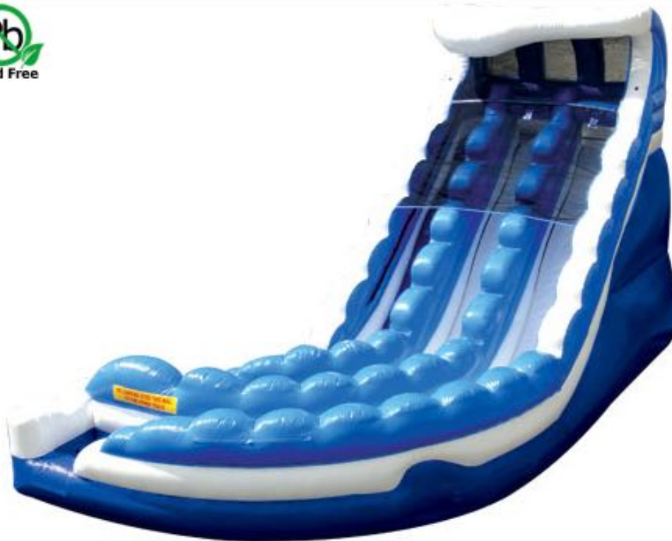
Ninjajump – DOUBLE SLIDE WATERSLIDE