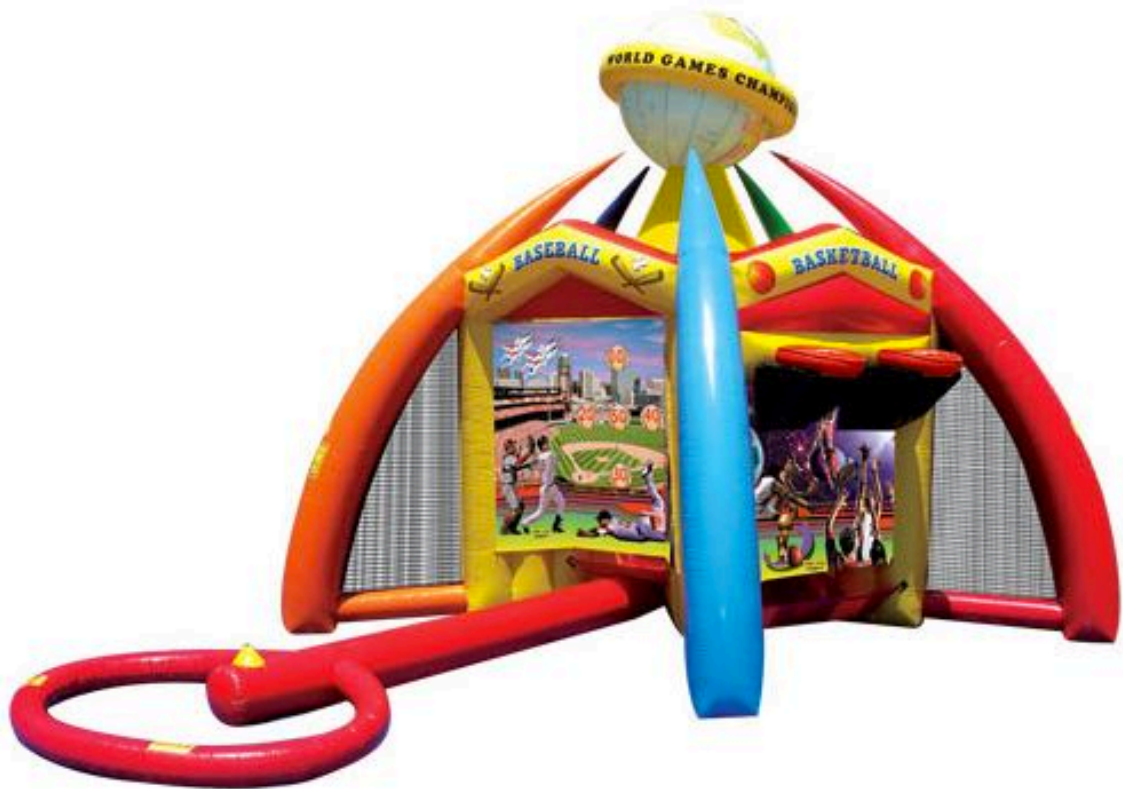
Ninjajump – JUNIOR SPORTS CENTER