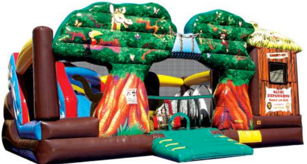
Ninjajump – SAFARI EXPERIENCE