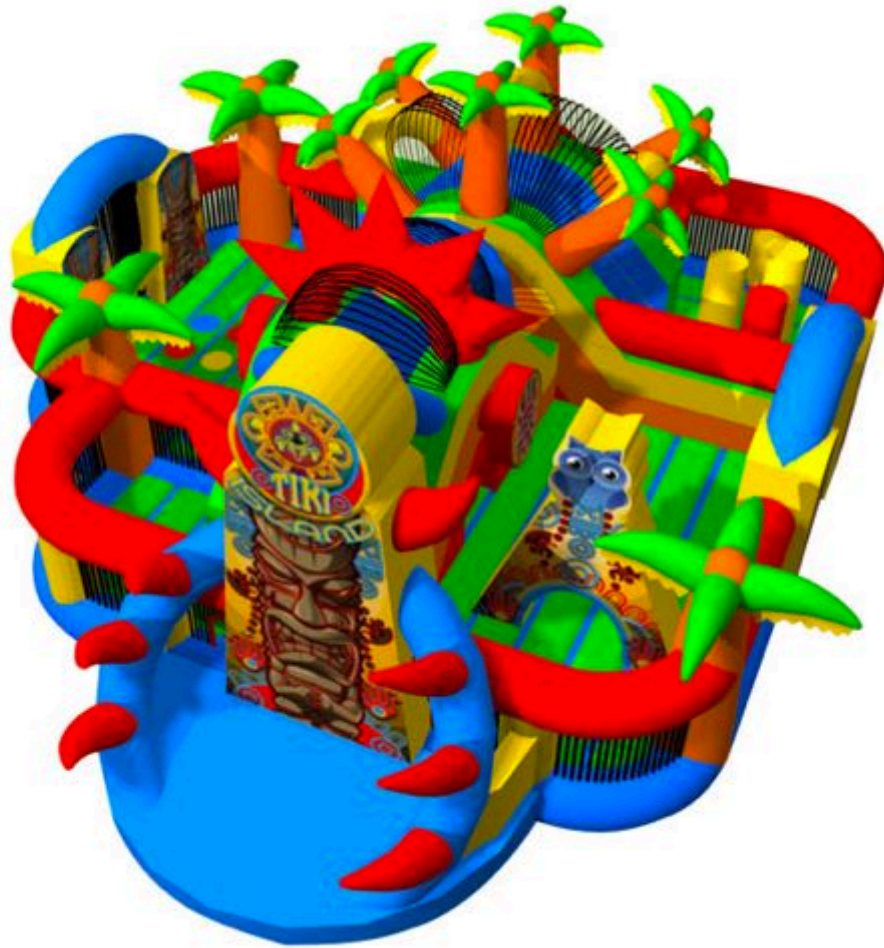
Ninjabump – TIKI ISLAND